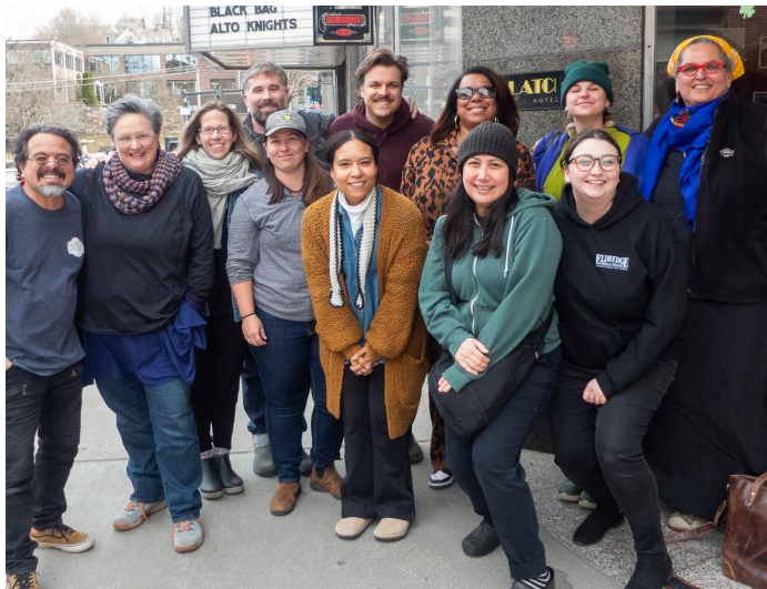
NFFC staff at our annual retreat in Brattleboro, VT.