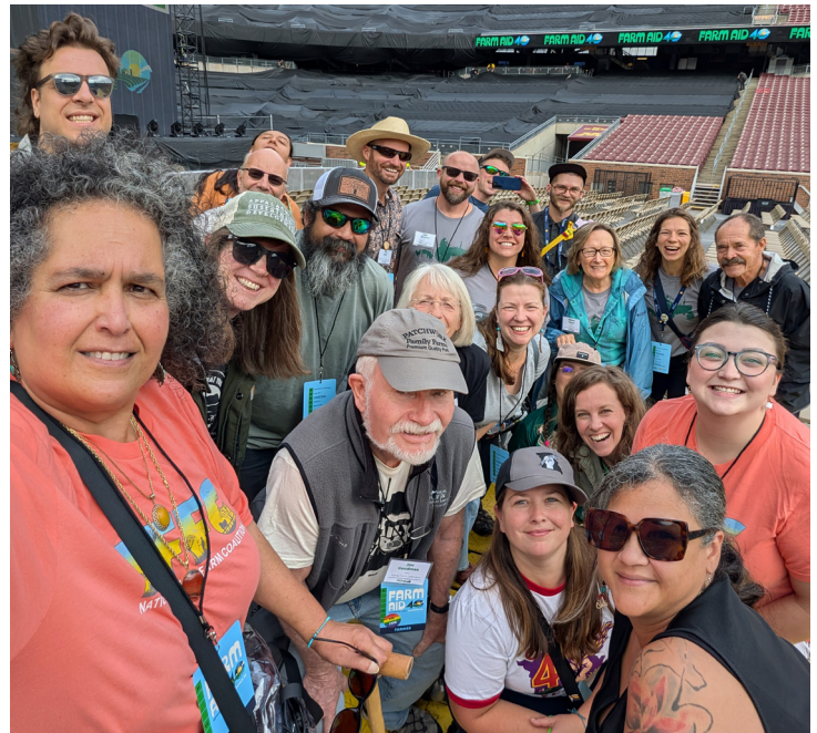
NFFC staff and members enjoying Farm Aid's 40th anniversary concert in Minnesota.

Both organizations have grown, in staff, budget and workload. Our mission of advocating for fair prices for farmers/ranchers and fisher-folk, a fair and just food system, respect and inclusiveness for farm workers, women, the indigenous, immigrants and minorities must go on as we again face some of the outrageous challenges of the current administration.