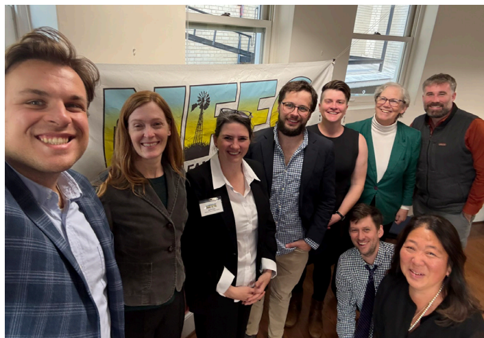
Coming together in Washington, DC for our fall "mini" fly-in in November.