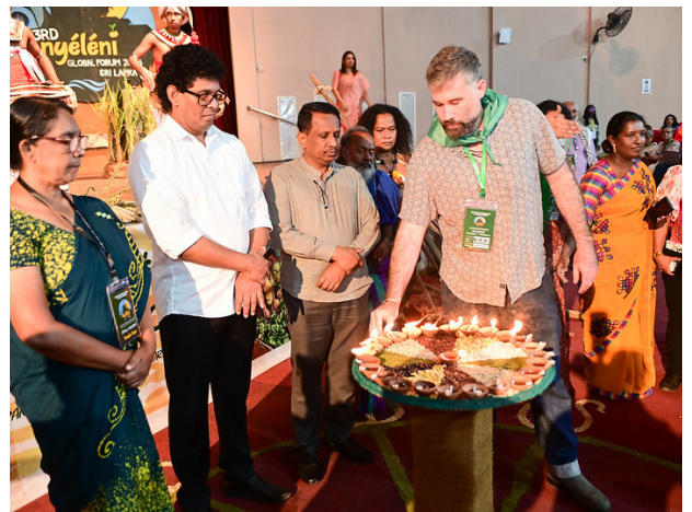
"Opening Ceremony Day 3" by 3rd Nyéléni Global Forum, CC BY-NC-ND 4.0