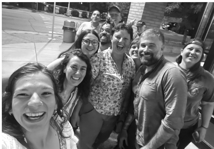
Staff and members hanging out after a day of strategizing during the annual gathering in Billings, MT.

This year, I was most excited about NFFC's expanded media reach and the cultivation and deepening of our relationships with reporters. We solidified news stories in the New York Times, the Hill, Politico, Hearst TV, Civil Eats, and more! It's incredibly gratifying to be able to support our members in getting their voices heard. We have big plans to continue to expand these vital opportunities for our coalition.