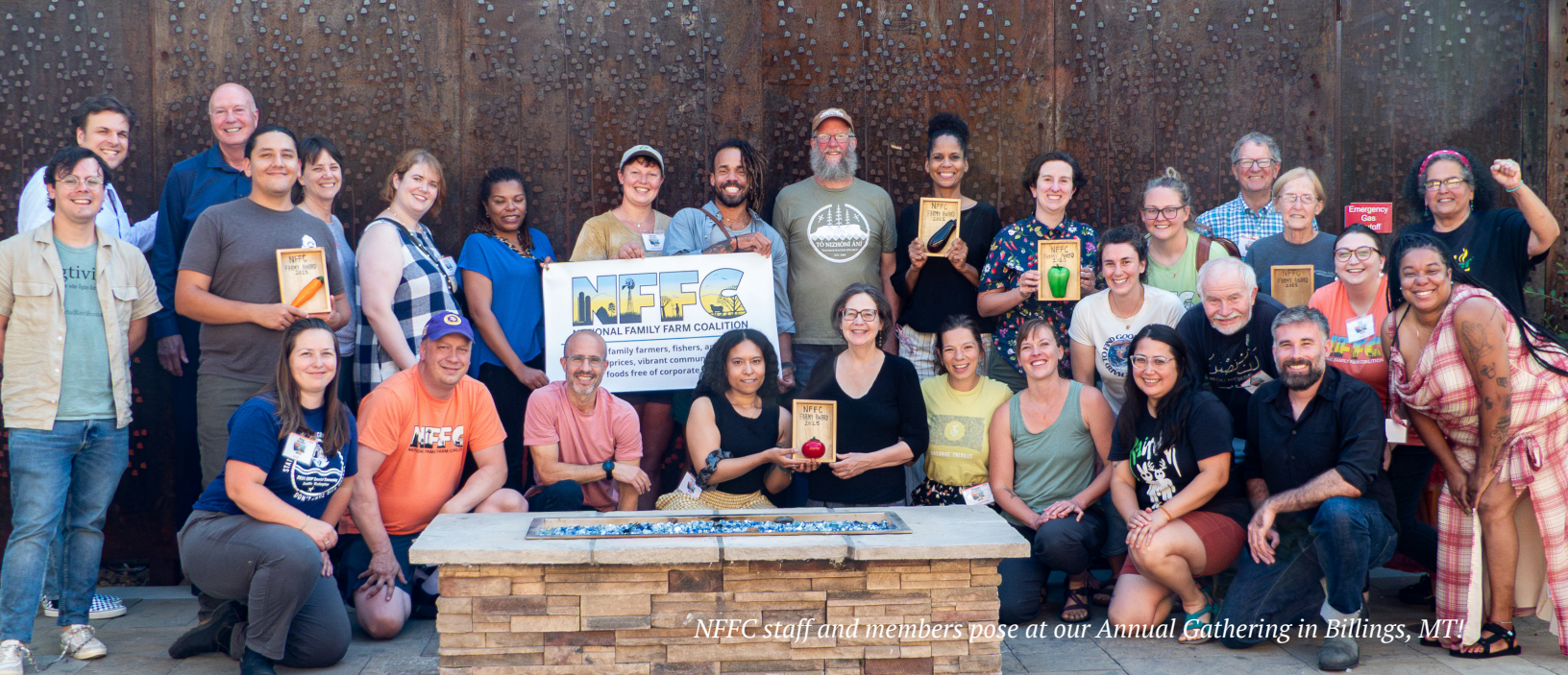
NFFC staff and members pose at our Annual Gathering in Billings, MT!