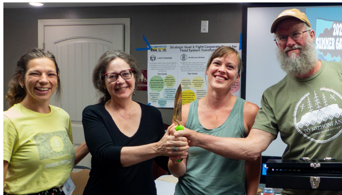
NOFA was honored with NFFC's Golden Trowel award for "most inspiring organization" at our 2025 Annual Gathering!

After doubling NAMA's team in 2024, this year we were a plant growing into a much larger pot! We knew we had to pace ourselves, take in plenty of water, and allow room for new roots to grow. Among other achievements, we built community around our Atlas for Values-Based Aquaculture, participated in the Turtle Island delegation at the Nyéléni Forum in Sri Lanka, convened Black and Native leaders in Alabama, and helped introduce the Keep Finfish Free Act of 2025.