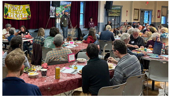
Rural Vermont celebrated their 40th anniversary with a festive celebration in Barre, VT.

2025 marked Rural Vermont's 40th anniversary with progress on key priorities identified by our agrarian community, and in collaboration with allies. This included: the bicameral (re-)introduction of the