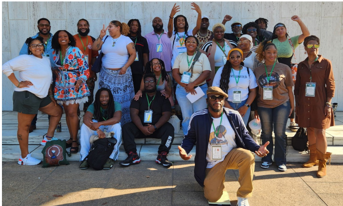
KBFA staff and members at the 2025 Black Urban Growers Conference.

Iowa won two local ordinances that provide some protections from Summit Carbon Solutions proposed CO2 pipeline. (Summit is a sister company to Summit Ag Group owned by factory farm kingpin Bruce Rastetter). CCI members also fought for more fair markets for cattle producers in particular, fighting for mandatory country of origin labeling for beef.