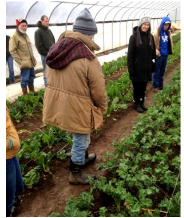
CFA members visit Athens, OH, greenhouse in February