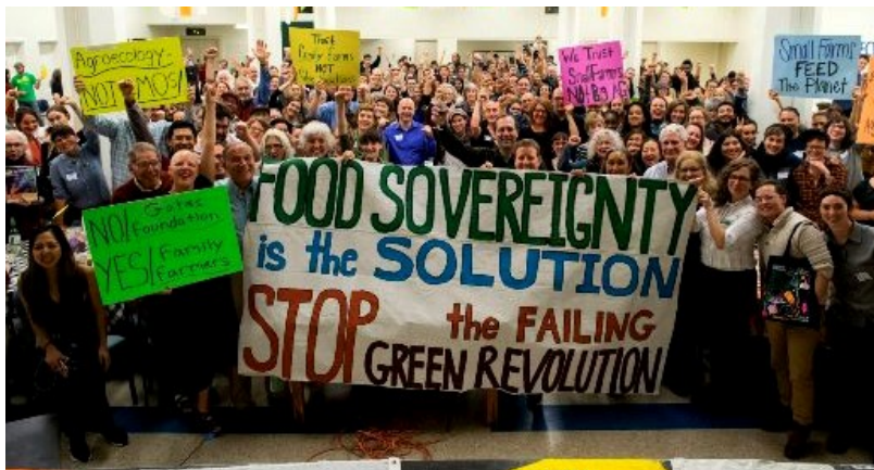
At CAGJ's 11th annual SLEE dinner, attendees send a message to the Gates Foundation, World Food Prize and their agribusiness partners

On October 21, CAGJ held its 11th annual Strengthening Local Economies Everywhere (SLEE) dinner , celebrating the critical work of small farmers and fisherfolk in building agricultural systems for themselves and their communities. We proudly acknowledged ZIMSOFF and NAMA as the Food Sovereignty Prize awardees, then gathered the 300-plus dinner attendees in a photo to send a message on social media to the Gates Foundation, World Food Prize, and their corporate agribusiness partners to confirm, as our banner reads, Food Sovereignty is the Solution! Stop the Failing Green Revolution!