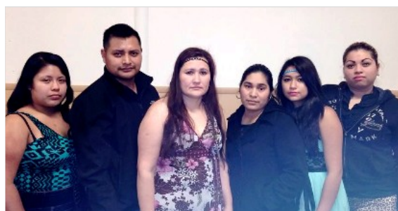
Workers at fish processing plant NORPEL and members of Pescando Justicia/Fishing for Justice Campaign.