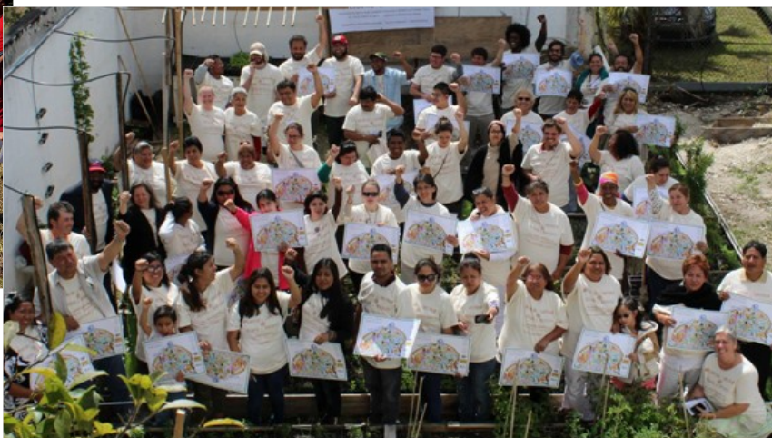
Participants who completed the Encuentro.