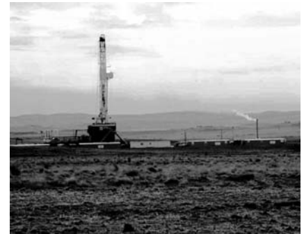
Fracking site in Wyoming

Wyoming shares many of Alberta's ingredients for catastrophe: increased fracking; a deep oil boom; and frack jobs clustered close to many older or orphaned wells. We certainly aren't immune from the potential for damage and contamination; with at least one reported case and rumors of other frack hits, Wyoming should implement preventative measures now.