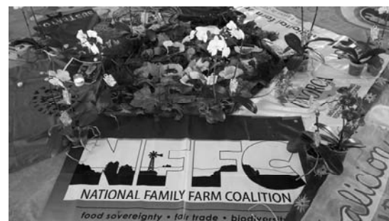
Mistika banners from the LVC regional meeting