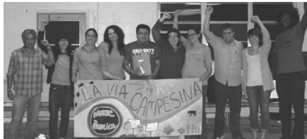
Youth Delegation at the North America LVC regional meeting in Florida

The youth delegation has not historically been a strong piece of La Via Campesina in North America. We discussed how to strengthen our collective, and communication is key. It is important that the member groups strengthen their youth involvement as well. Having young people involved is important for any group. They are the future; they can bring energy, new perspectives, and ideas to the movement.